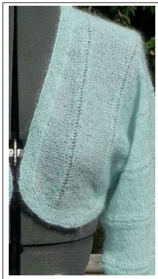
Coniston Beaded Bolero (page 4)